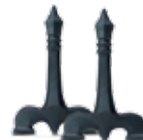
Decorative andirons + Decorative grate (For CTCL24)