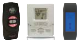
See our Ambient Technologies® catalog for a complete line of remotes and thermostats.