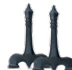
Decorative andirons + Decorative grate (For CTCL24)