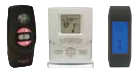
See our Ambient Technologies® catalog for a complete line of remotes and thermostats.